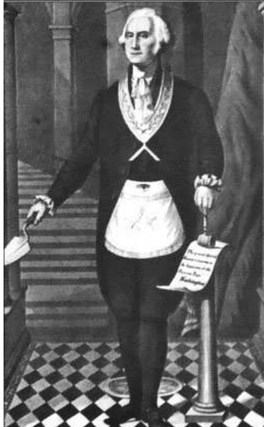
Original painting-Library of Congress